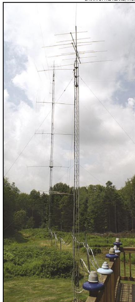
Two of the six towers at the Peru, Massachusetts home of Dave Robbins, K1TTT. The 60 foot tower (foreground) has both 6 and 10 meter beams, while the 150 foot tower boasts 4-element 20 meter beams.