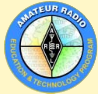
Iowa Street School provides a ham radio enrichment program for home school students.