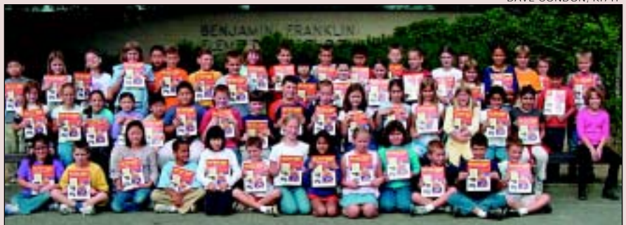
Franklin Elementary School has 75 fourth graders studying for their Technician licenses.