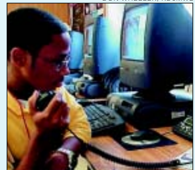
SKYWARN is an important part of Amateur Radio at Richwood High School. This year students participated in SET exercises.