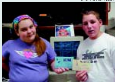
Central Square Middle School students worked the digipeater station on the International Space Station.