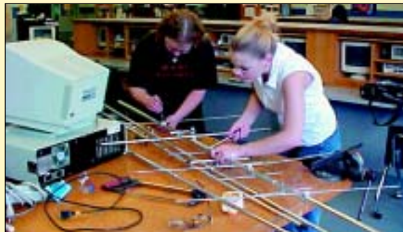
C-4 Columbus North High School students assemble the antenna system they received as a result of being selected a program Pilot School.

This is a great opportunity for students here and I thank the ARRL and all the sponsors of the Amateur Radio Education & Technology Program for donating the equipment. We are putting it to good use.